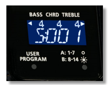
We will work through this little puzzle together.

We will physically customize the accordion to your own personal style and preferences - touch, levels, convenience choices, and especially the bellows on several fronts.