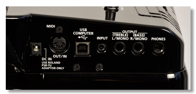
NAVIGATION - We will go over all of these connections together

We will look over the instrument and understand the controls. We