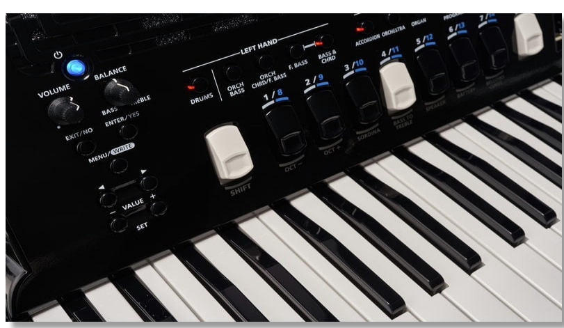
Does any of this confuse you? Then you are in the right place!

Not necessarily. If you are just curious, or interested in